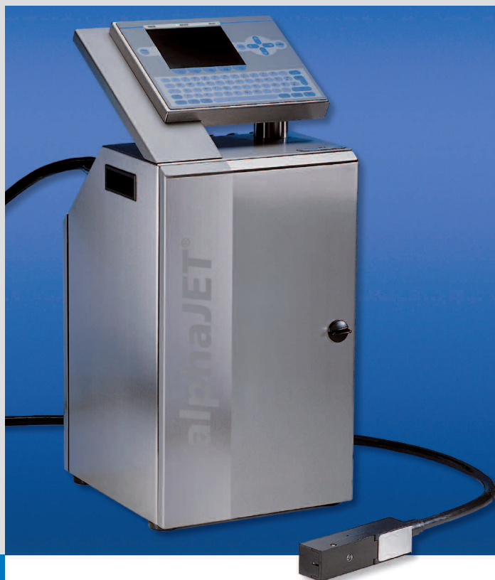
Measurements of High-Speed print head: