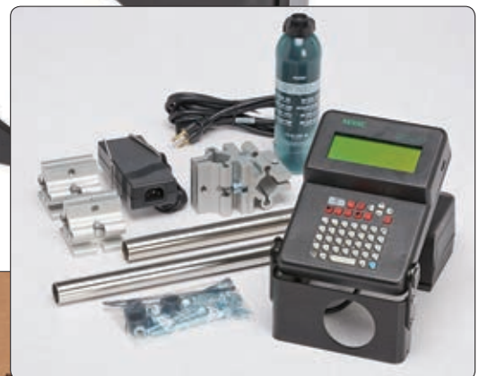
Pieces included in package